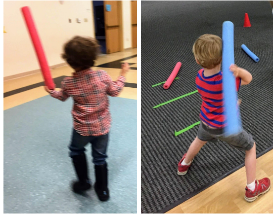
B: Individual Noodle Games: Hand Balance, Pop-up, Javelin