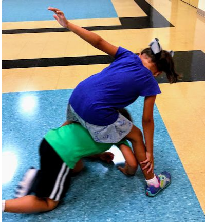
A: Triangle Tag