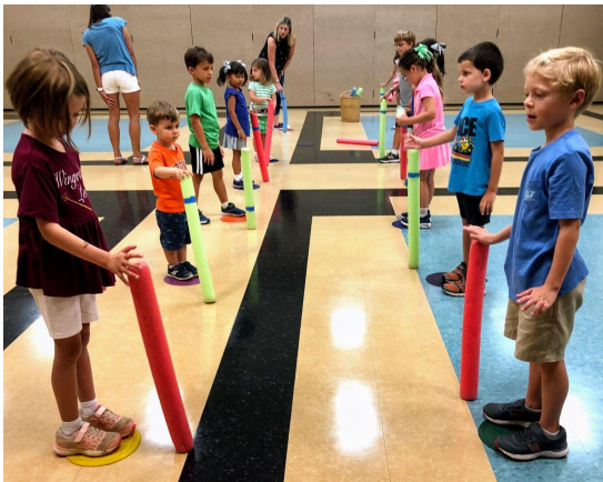
C: Noodle Partner Switch