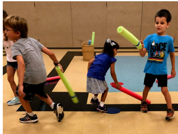
D: Noodle Toe Tag